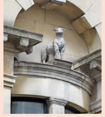
21 © Richard Arnopp, 2024