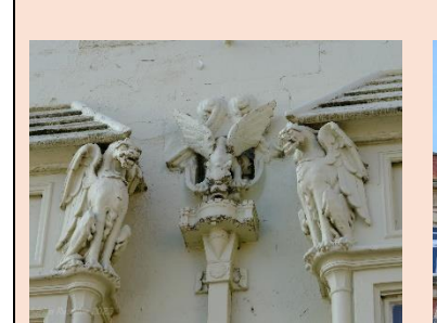
17 © Adrian Rushton, 2024