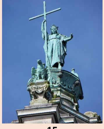
15