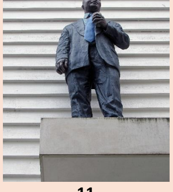
11