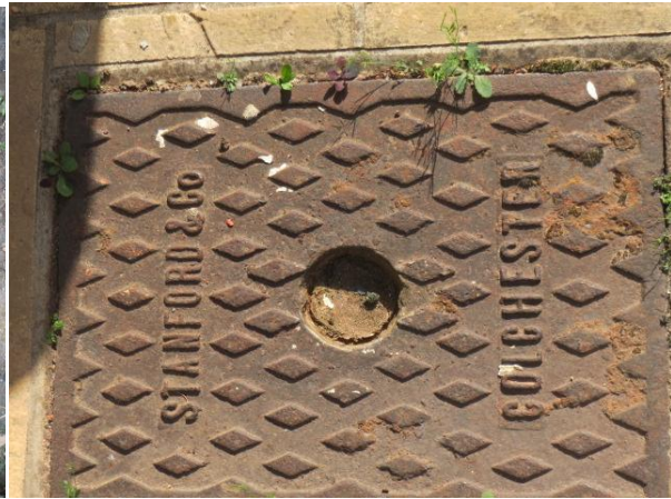
A small Stanford “nut” cover.