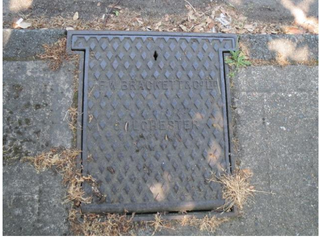
F.W.Brackett & Co hinged drain.