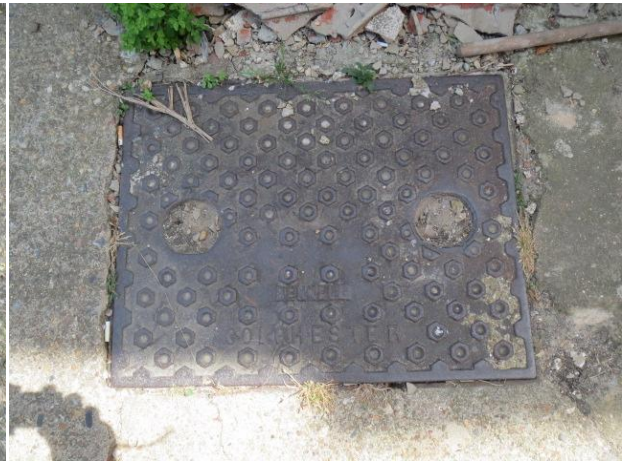
Bennell “nut” pattern inspection cov