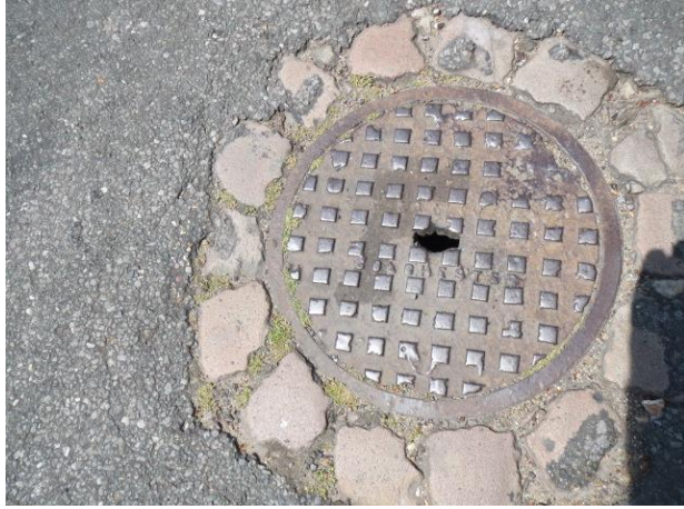
A Colchester manhole cover

As well as the named foundry manhole covers there are several where the names have worn away from use but also some that only marked “ Colchester “. There are also those that I list as ring drains.