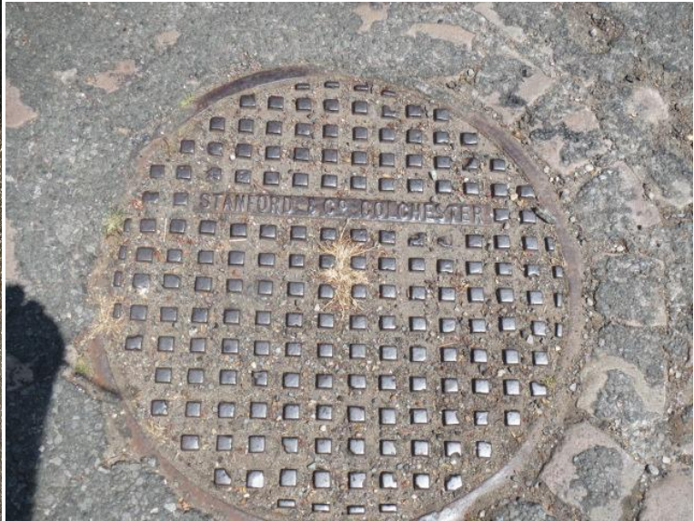
A standard Stanford inspection cover Stanford manhole cover.