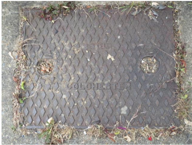
Bennell diamond pattern inspection cover

Bennell & Co Greenstead Road 1870 – 1899.