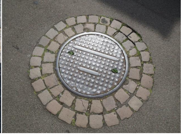
Name polished away from use or from design ?