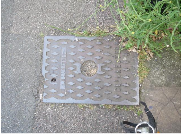
F.W.Brackett inspection cover