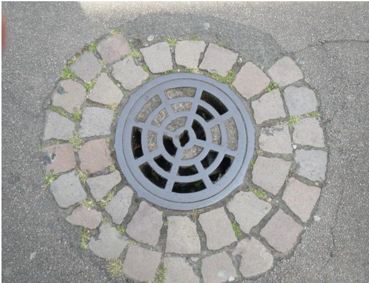
A ring drain as found all over the Borough but not usually with the granite sets. Unknown maker.