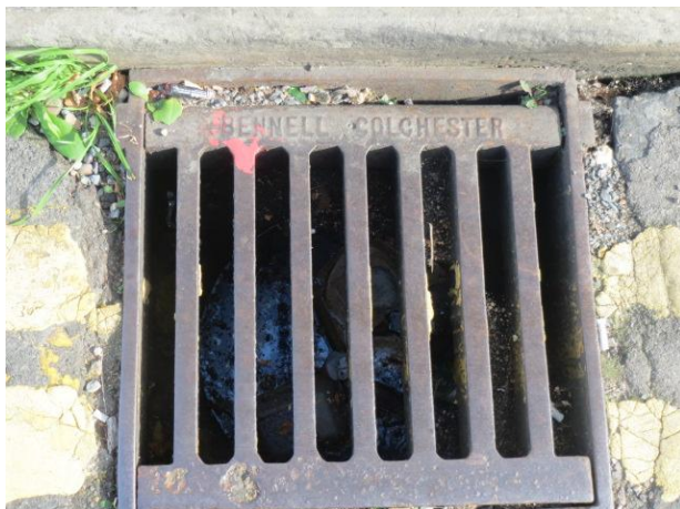
Bennell Colchester drain.