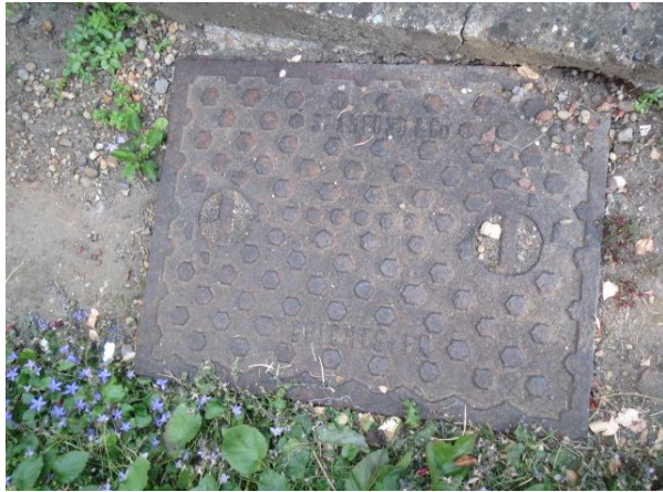
Stanford “nut” pattern inspection cover

Stanford & Co 1889- 1920 (but possibly from 1874)