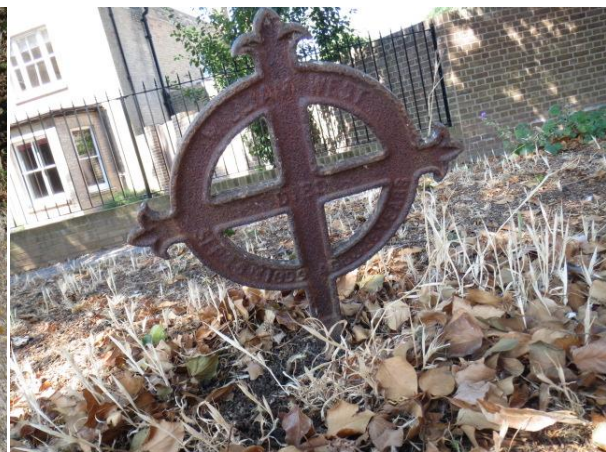
Grave markers at St Andrew's ,Marks Tey dated to 1909 and 1889 but no casting maker.