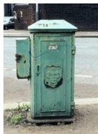
A Lucy box in Wolverhampton

I believe the tram system would have used cast iron junction boxes with the power system in common with other municipal corporations like Wolverhampton or Bournemouth. Two such boxes survive in the Castle Park , one in the Rangers Area and the other close to the Castle Road exit to the park. These were also used as part of the general electricity supply network. They are often known as “ Lucy “ boxes after the name of the main suppliers, the Lucy Foundry of Oxford. They usually incorporate a casting of the borough arms in the design . I have discovered a photo from Bournemouth of a box there with the name of the Britannia Engineering Co. of Colchester in the casting .