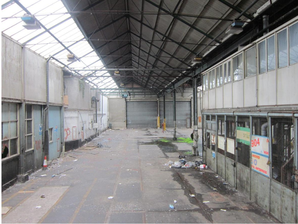
A photo found on Facebook of the inside of the tram depot and the tram lines are still quite visible on the right hand side.