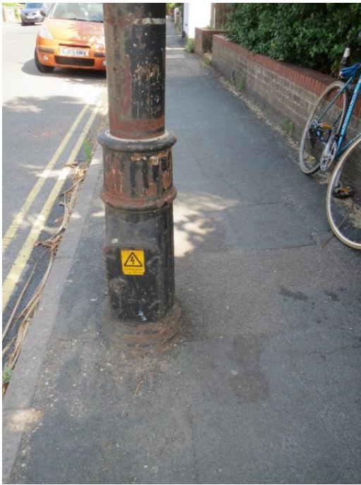
Tram Traction Pole base, Greenstead Road.

The electrical power for the tram system came from the Colchester Corporation power station in Osborne Street approximately where the multilevel car park is now.