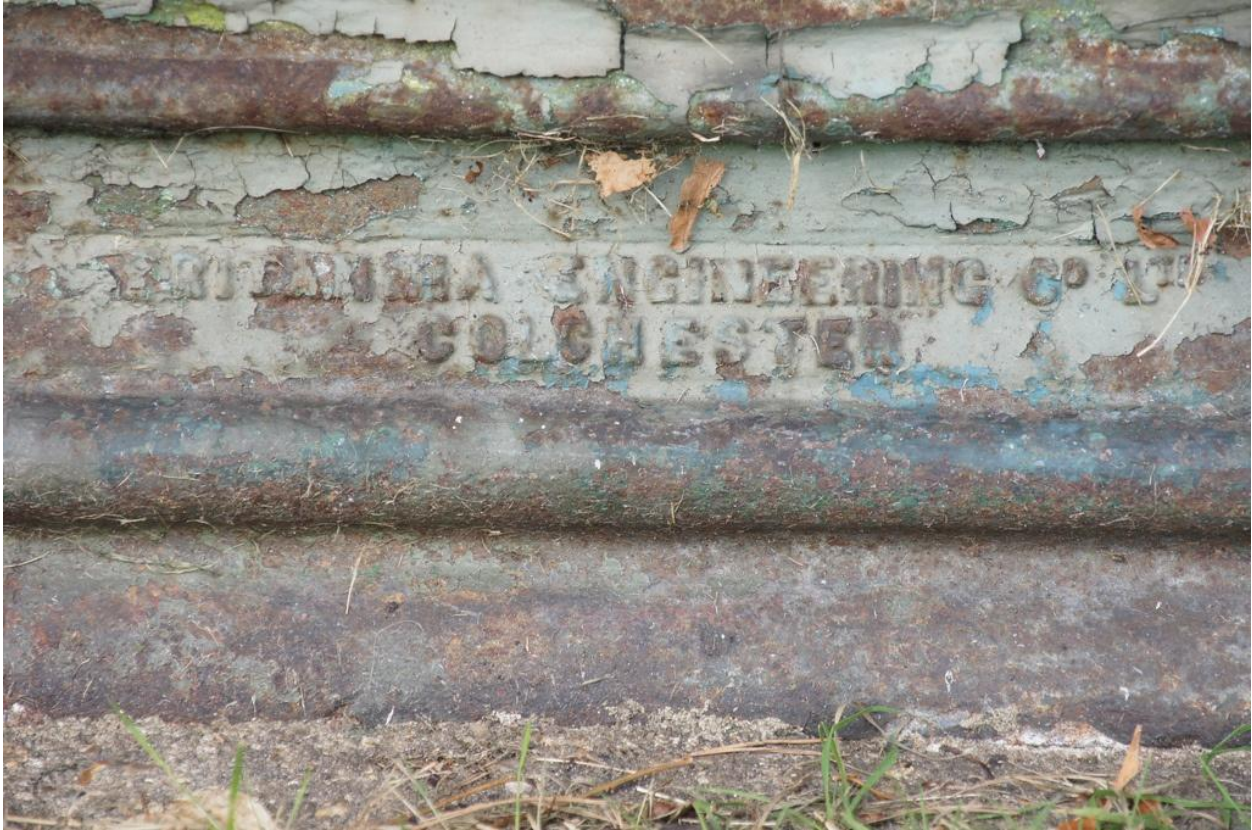
In the Bournemouth casting of the Lucy box