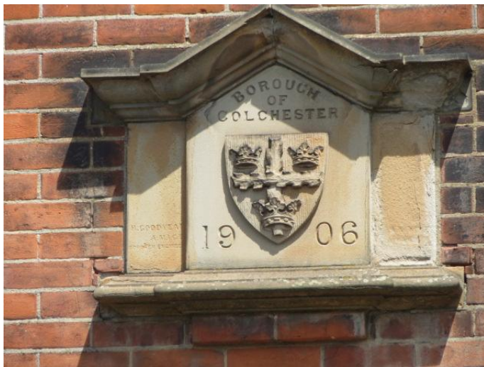
Military Road tram storage depot

A collection of that which remains in the town and some old photos in memory.