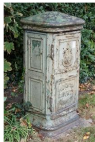
A Bournemouth Lucy Box