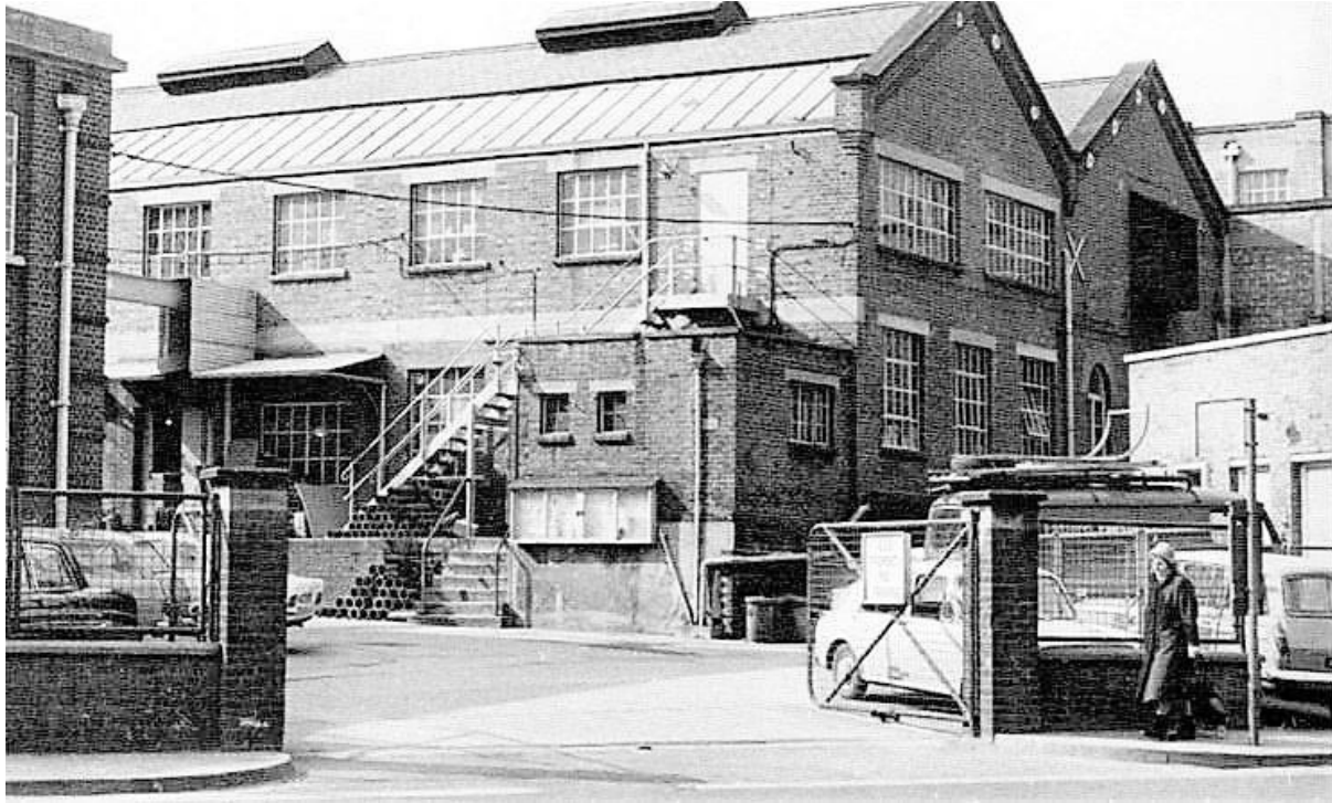
The Osborne Street Electrical works

I believe the tram system would have used cast iron junction boxes with the power system in common with other municipal corporations like Wolverhampton or Bournemouth. Two such boxes survive in the Castle Park , one in the Rangers Area and the other close to the Castle Road exit to the park. These were also used as part of the general electricity supply network. They are often known as “ Lucy “ boxes after the name of the main suppliers, the Lucy Foundry of Oxford. They usually incorporate a casting of the borough arms in the design . I have discovered a photo from Bournemouth of a box there with the name of the Britannia Engineering Co. of Colchester in the casting .